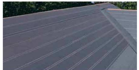
Shingle-Mate® roof deck protection resists moisture, so it lays flatter!