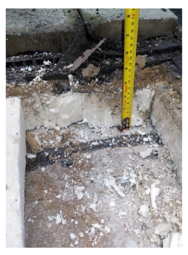
Photo 11 Exploratory cut in existing roofing system at the roof below the track.